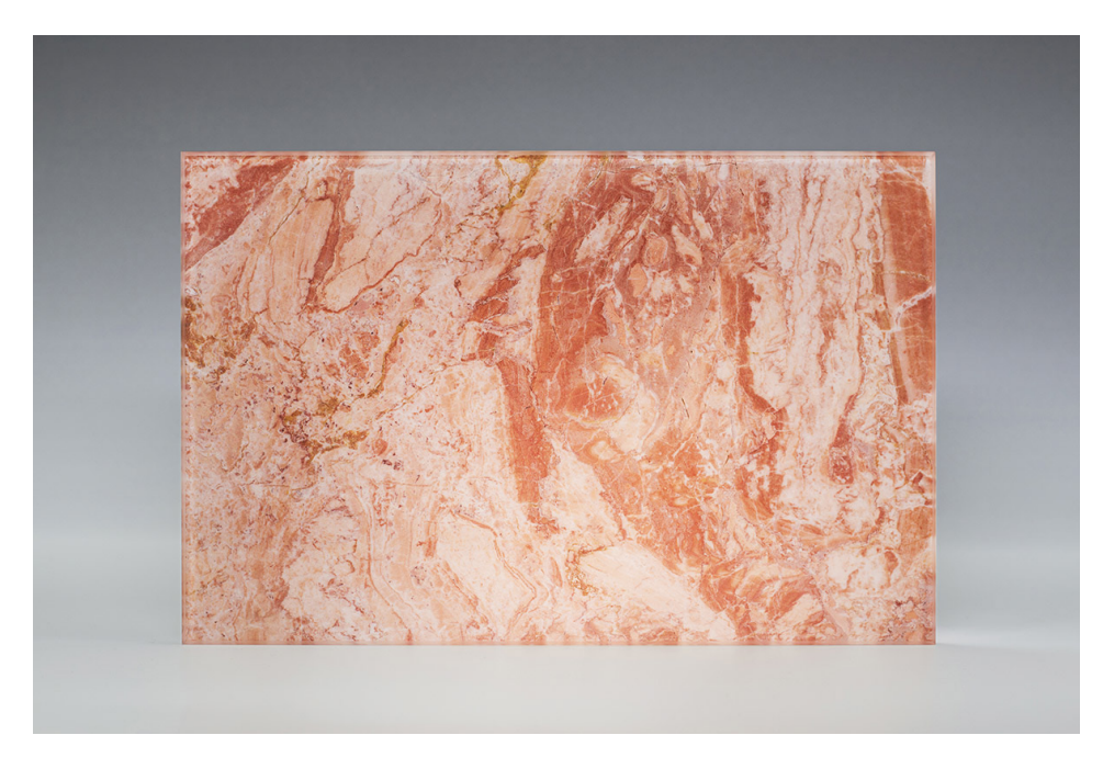
dim. 300 x 200 mm

We create a magnificent stone effect by digitally printing a natural stone texture, marble or onyx pattern in high resolution. Our stone samples are high-resolution scans of real minerals, manipulated so that there is no pattern repetition on the glass surface. These are simple and economical solutions for all interiors, especially where the price of real stone is not acceptable. Perfect for large public and private spaces. Backlighting gives this kind of glass a nice transparency and luxurious feel, especially where natural or reflected light cannot penetrate, for example in hotel receptions, bars, restaurants and other hospitality venues.